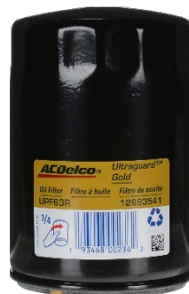
Spiral wound with louver design