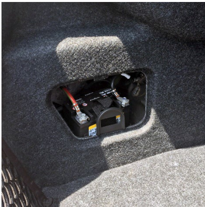
2015 Chevrolet Malibu LTZ Trunk side-wall example

Molded in for a superior seal with threaded inserts for secure wire attachment, colored epoxy and embossed polarity symbols for safety and convenience, the ACDelco AUX Battery Terminals are built to match your vehicle's connection requirements and provide long maintenance free life with excellent electrical conductivity.