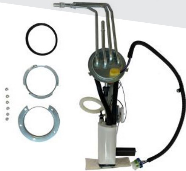
FUEL PUMP TANK MODULE ASSEMBLY