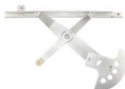
OES Part # Professional Part #11R297 97-05 Chevrolet Malibu 04-05 Chevrolet Classic Power Window Regulator Front Left

With 1,127 part numbers that fit right, the first time.