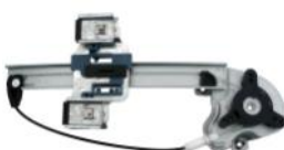
Professional Part #11R39 00-05 Pontiac Bonneville Power Window Regulator Rear Left