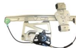
Professional Part #11R299 97-05 Cadillac Deville Power Window Regulator Front Left