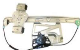
Professional Part #11R300 97-05 Cadillac Deville Power Window Regulator Front Right