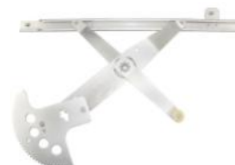
Professional Part #11R298 97-05 Chevrolet Malibu 04-05 Chevrolet Classic Power Window Regulator Front Right

ACDelco OES and Professional Window Regulators and Motors