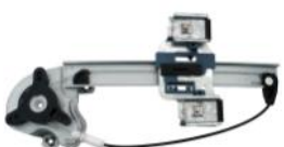
Professional Part #11R40 00-05 Pontiac Bonneville Power Window Regulator Rear Right