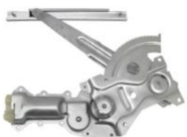
Professional Part #11A56 92-98 Pontiac Grand Am 92-98 Oldsmobile Achieva Motor and Regulator Assembly Rear Right