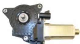
Professional Part #11M160 00-05 Buick LeSabre 00-05 Pontiac Bonneville Power Window Motor Front Right and Rear Left