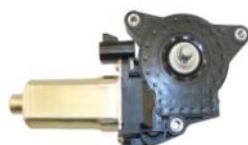
Professional Part #11M159 00-05 Buick LeSabre 00-05 Pontiac Bonneville Power Window Motor Front Left and Rear Right