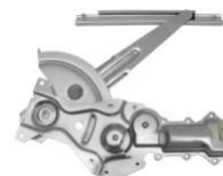
Professional Part #11A55 92-98 Pontiac Grand Am 92-98 Oldsmobile Achieva Motor and Regulator Assembly Rear Left